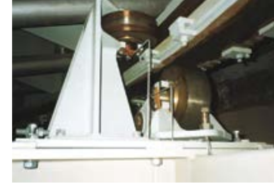
SUPPORT AND CENTERING ROLLERS Filter frame is supported and centered by sets of rollers mounted on nodular cast iron supports