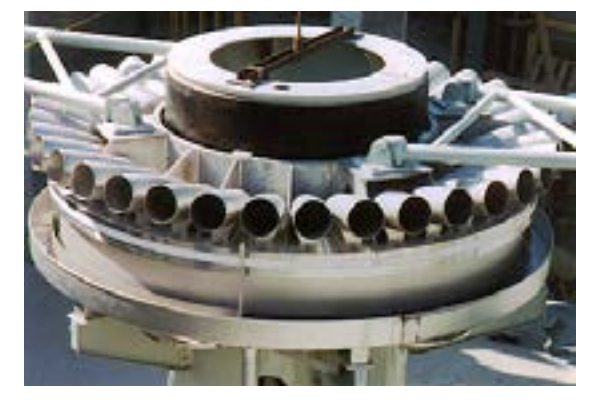
The upper part of the filter valve is easily raised for fast inspection or adjustment