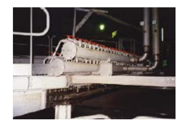
CLOTH AND TABLE WASHING The cloths are cleaned under pressure by two spray banks fed by one or two central manifolds. Residual gypsum is removed and cloths and table are washed to prevent scaling.