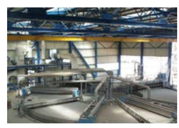
UCEGO NO. 12 A Under assembly – general view