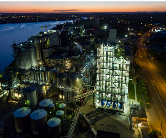
Manildra - Extra Neutral Alcohol Unit, Australia