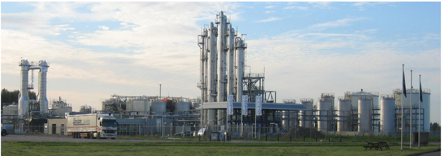
Cargill - Wheat Starch Slurry Distillery, France

A high-performance process for beverage and fuel applications